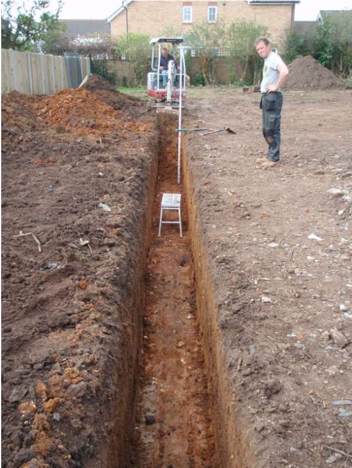
Plate 3. The site showing cutting of foundation trenches (facing south-west)