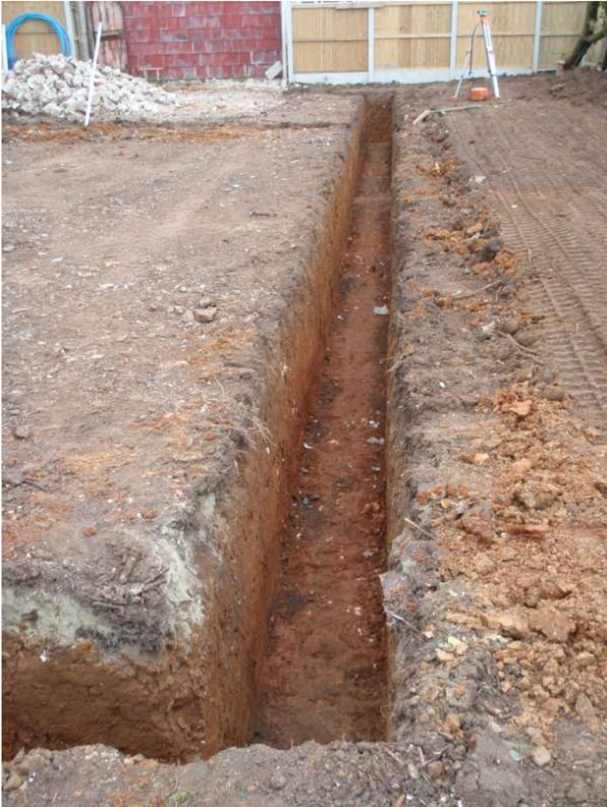
Plate 4. Foundation trenches (facing north-east)