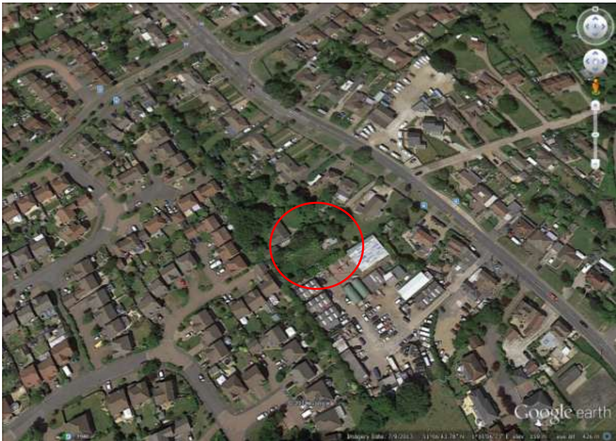
Plate 1. Aerial view of site (red circle) showing the site prior to development.