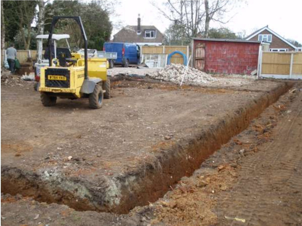
Plate 2. General view of site, facing north